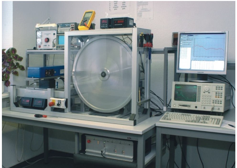
The new test stand for VLM 200 gauges

In order to further improve the quality standard of the VLM 200 equipment, we have developed a new test stand. More effective operating sequences and a higher level of automation have thus been achieved.