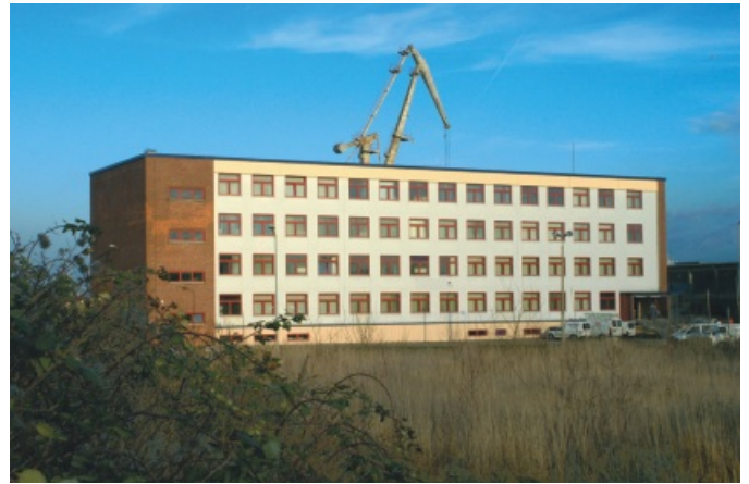
The CTG building the new company headquarters of the ASTECH GmbH

The new location allows us to further improve the operative processes and to increase production capacity. This means that we are in a position to react in a faster, more flexible manner to our customers' requirements. Since we were using the telephone system at the Technologie-zentrum and now have our own telephone system, our phone and fax numbers are changing. You can reach us at our new address: